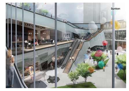
Sunken Design Concept