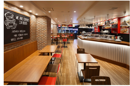
As built interior